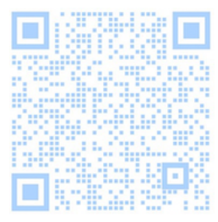
微信 / WeChat

email: hello@learningleaders.com phone (China): +86 021 8027 0883 phone (USA): +1 973 975 0888