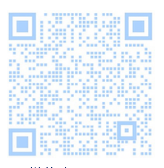
微信 / WeChat

email: hello@learningleaders.com phone (China): +86 021 8027 0883 phone (USA): +1 973 975 0888